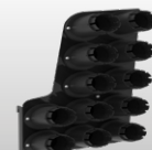
Die Storage Panel EVO