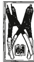
7053K internal & external plier, 4 sizes of tips.

No. 209201 – Replacement tips (pr.) for the 7300 and 7301 pliers. Wt., 0.1 kg.