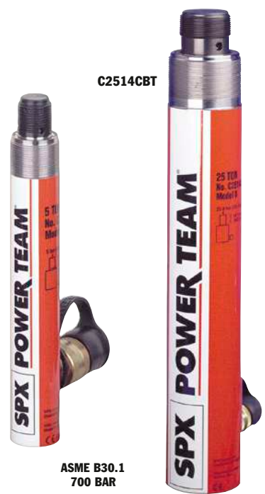
ASME B30.1 700 BAR